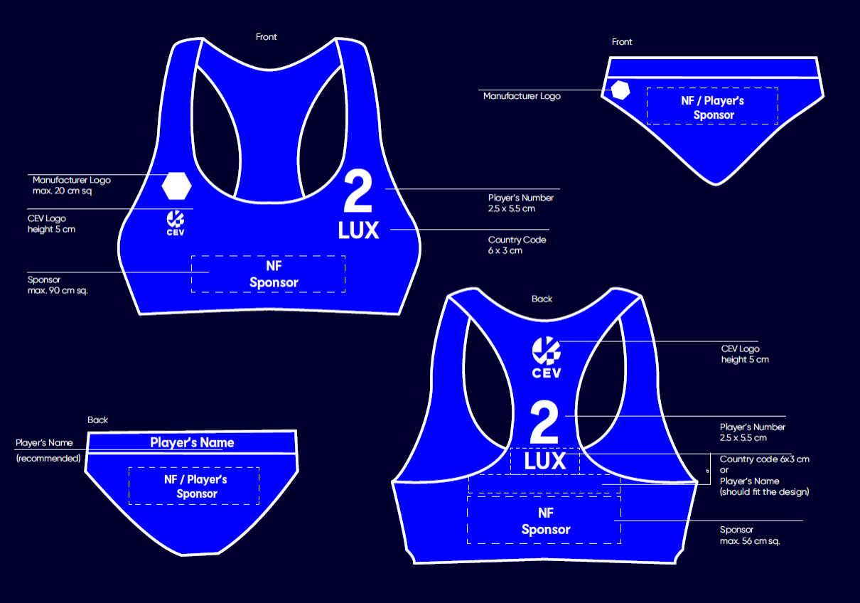
Logos and numbers should be always well visible, and in a contradictory colour to the uniform